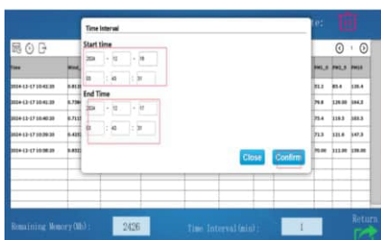
Historical data export